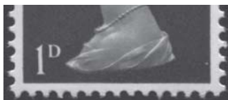
Type A1 Flat base