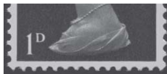
Type B1 Curved base

Head Type A1 – The base of the portrait bust is clear-cut without shading below it, so that its outline looks flat.