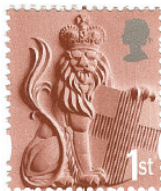
Lion & Cross of St. George