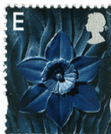
Daffodil Ieuan Rees (slate)