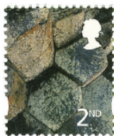
Giants Causeway