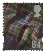
Tartan Kinloch Andersen of Leith (material)

The designs were based on materials originated by the artists listed beneath each illustration above. The medium used is given in brackets. The lion, thistle and tartan designs were photographed by Julyan Rawlings for reproduction on the printed stamps.