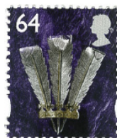
Prince of Wales Feathers Rhiannon Evans (gold & silver)

The designs were based on materials originated by the artists listed beneath each illustration above. The medium used is given in brackets. 1st and 2nd stamps have value tablet in both English and Welsh.