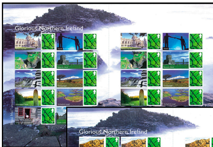
Retail Generic Sheet

Retail Smilers , the most common which includes standard customised and generic sheets, usually in sheets of 20 stamps and labels (although some customised issues are known in sheets of 10, A5 –148 x 210mm – in size). Not every generic sheet has a