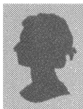
Type 2 Poorly defined

Type 1 and 2 Heads. Around the middle of 2005 Royal Mail became dissatisfied with the Queen's head that De La Rue were using on all current England values. The silver printed head was less well defined and lacking in crispness when compared with initial England full bleed stamps and on values from other regions. They therefore took the decision to replace the cylinder that printed the silver with one restoring the head to its originally intended form.