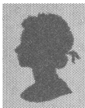
Type 1 Sharper features