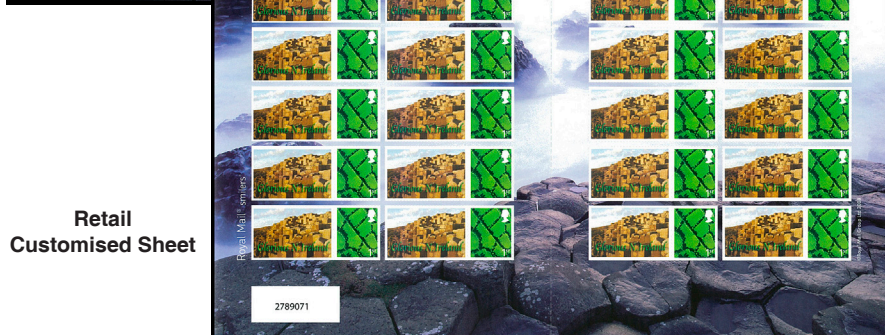
Retail Customised Sheet